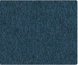
Indian Ocean 4007-07