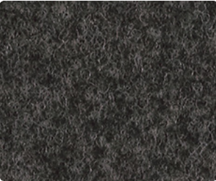
Pinon Tree 4007-04