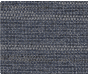
Rio Grande 7022-07