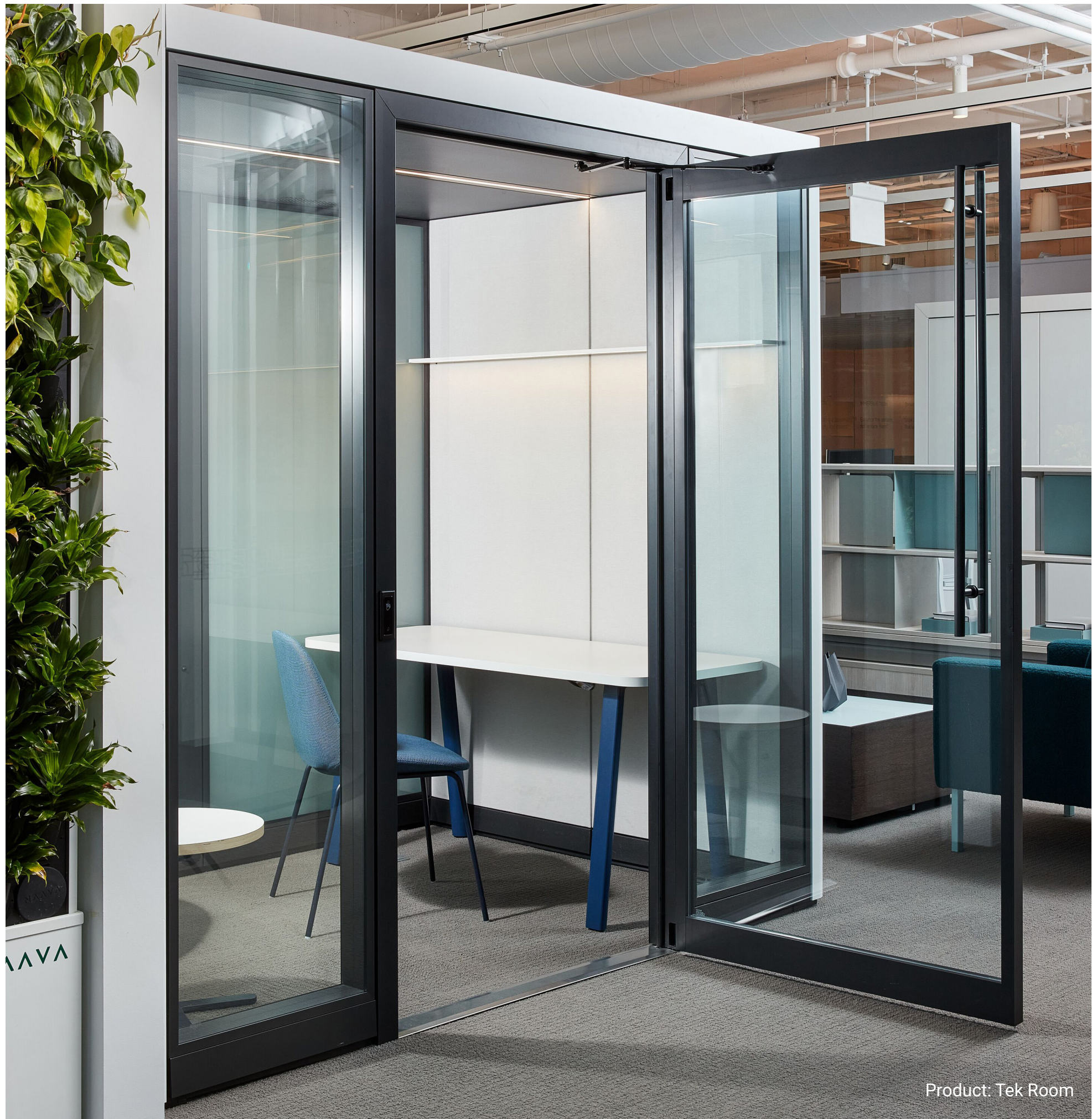
Product: Tek Room