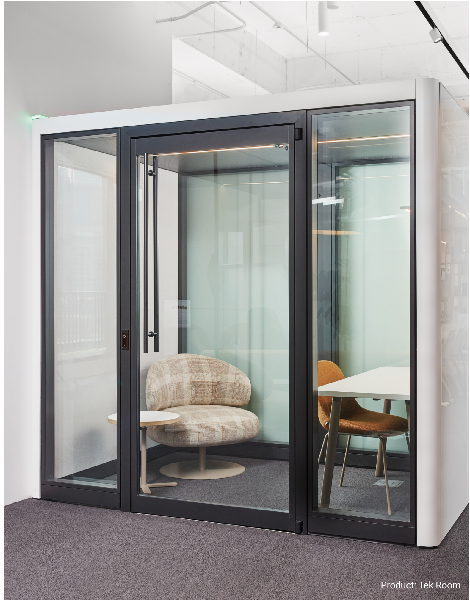
Product: Tek Room