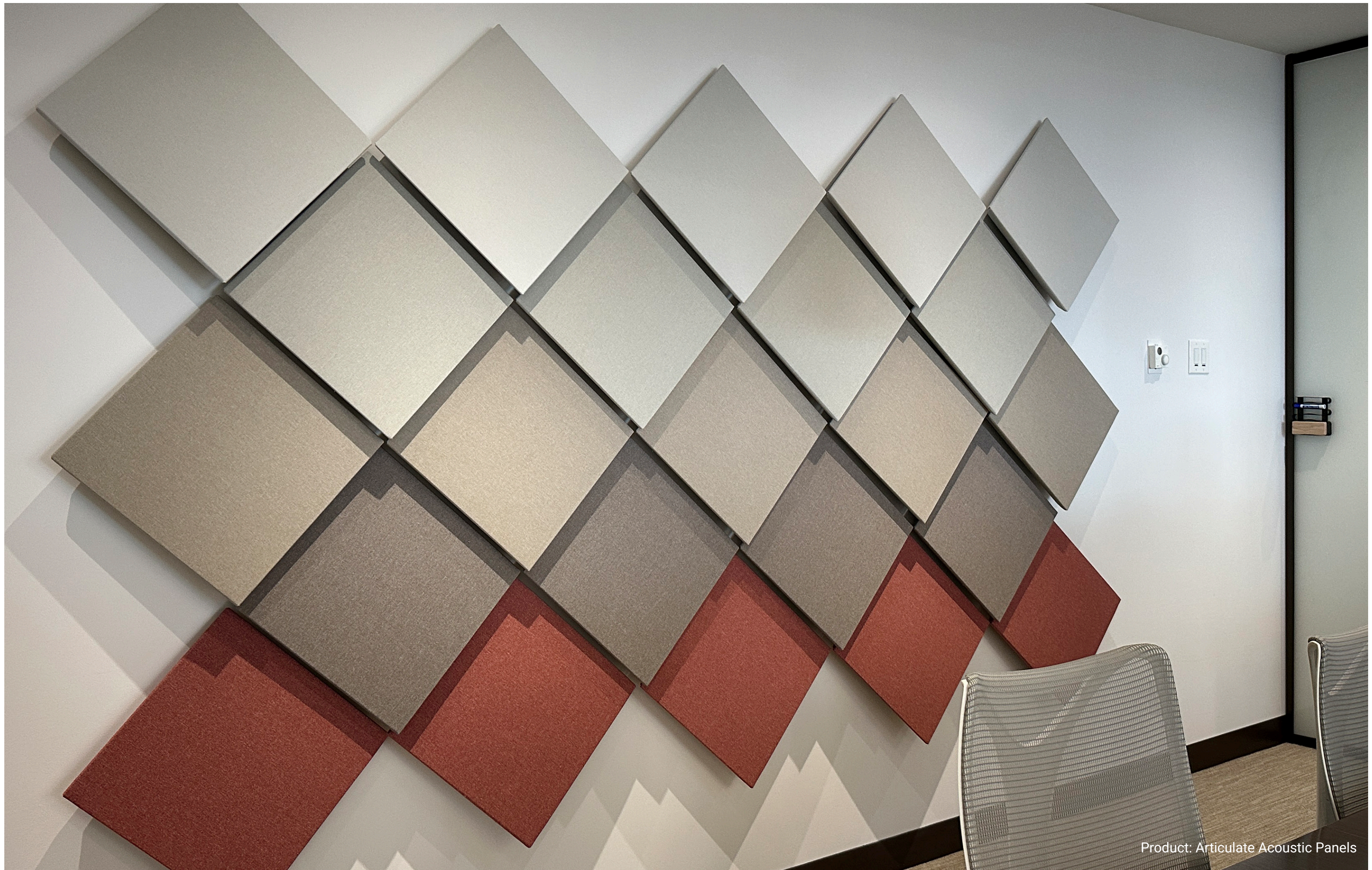
Product: Articulate Acoustic Panels