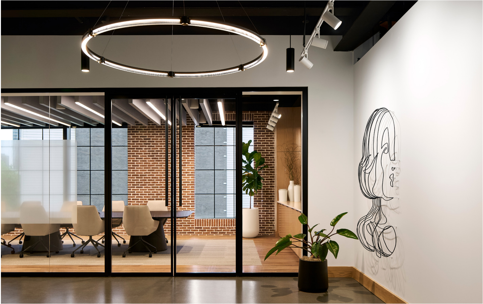
Product: Tek Vue