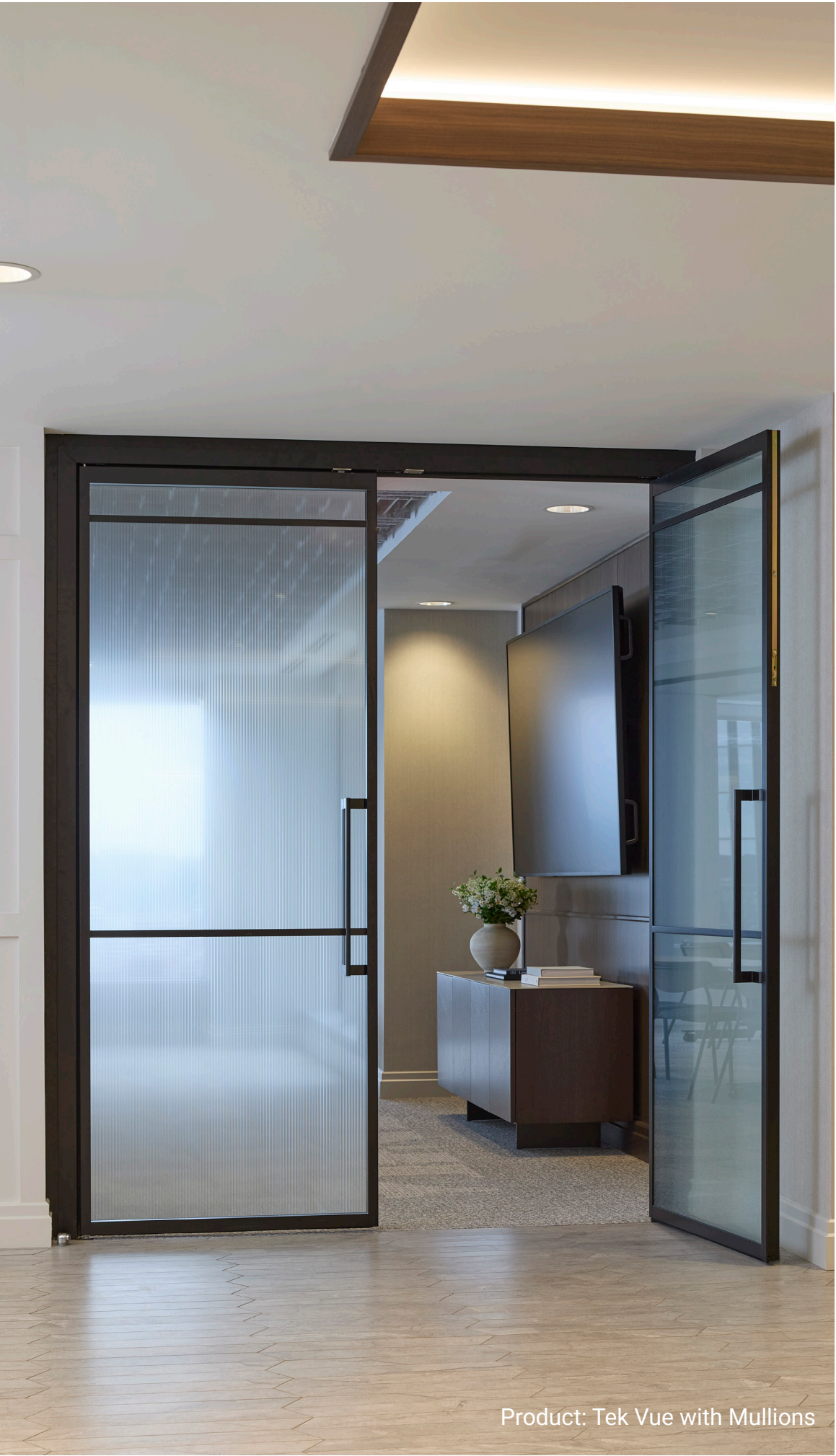
Product: Tek Vue with Mullions