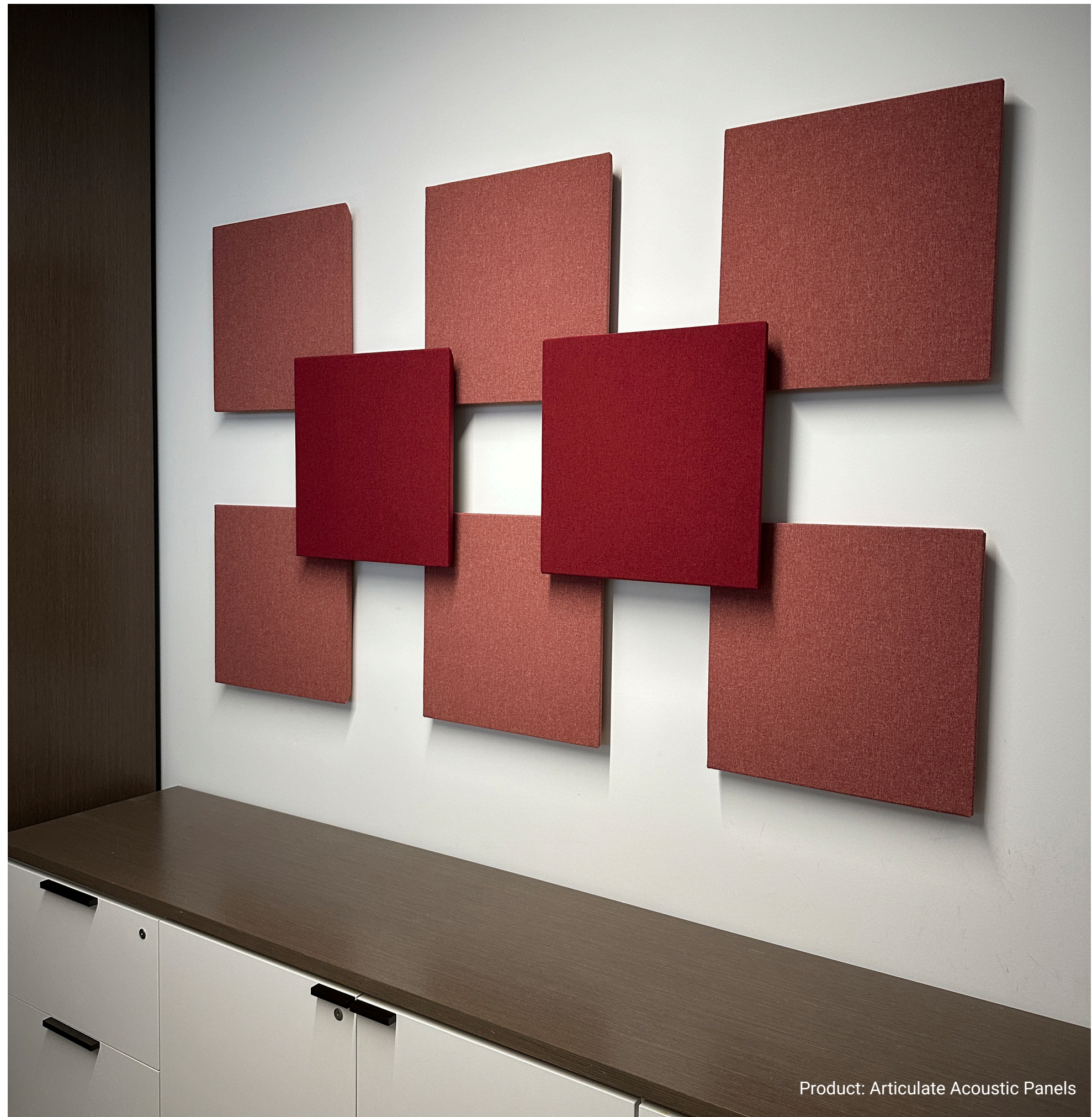
Product: Articulate Acoustic Panels