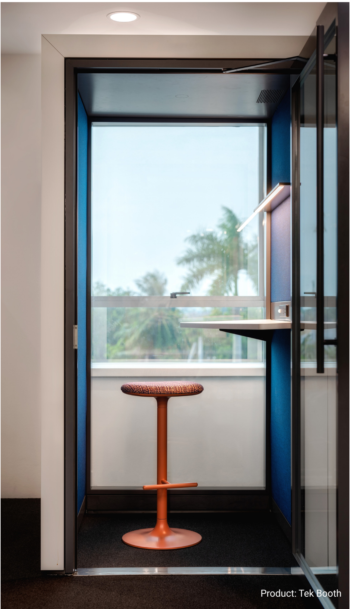
Product: Tek Booth