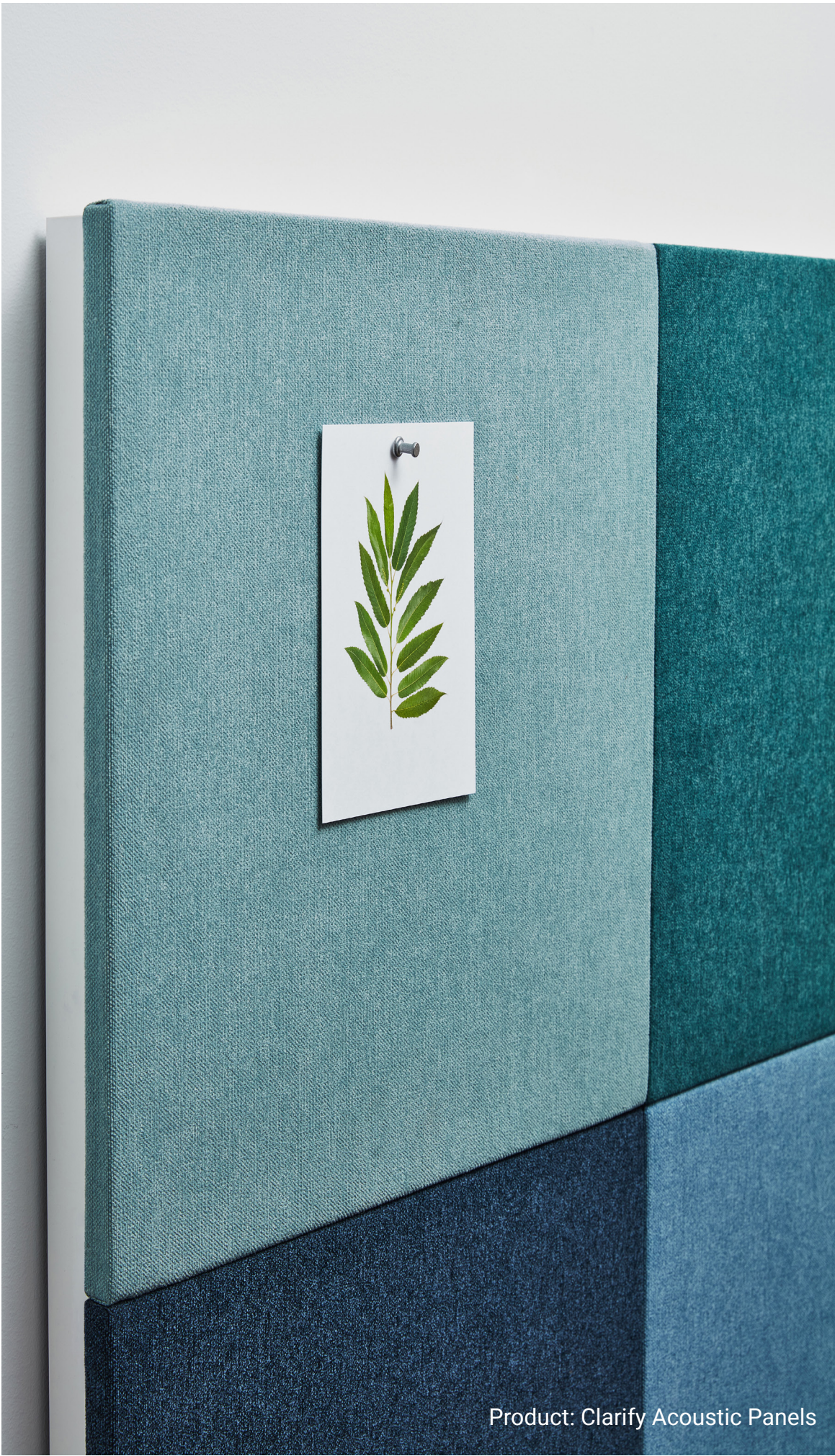
Product: Clarify Acoustic Panels