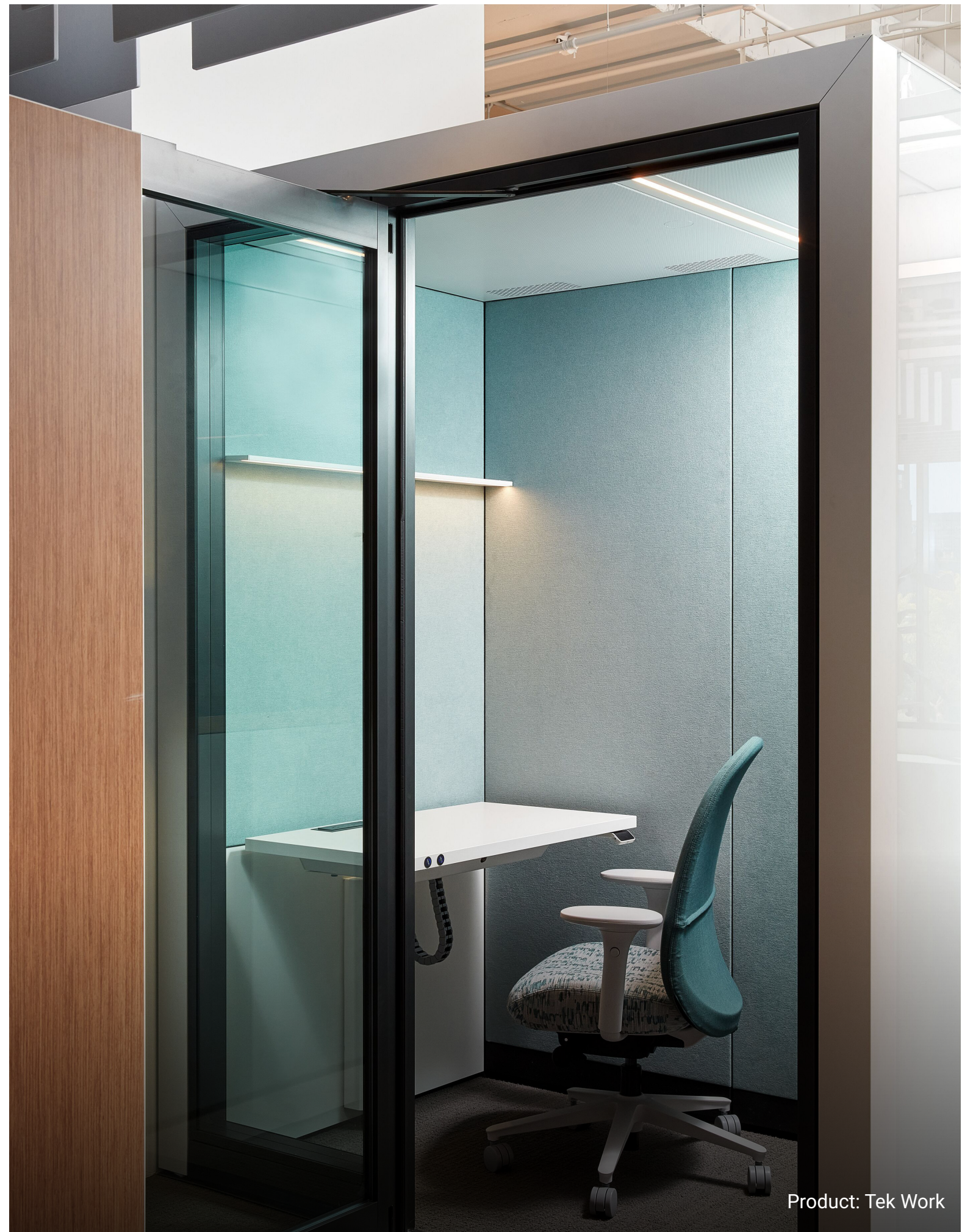
Product: Tek Work