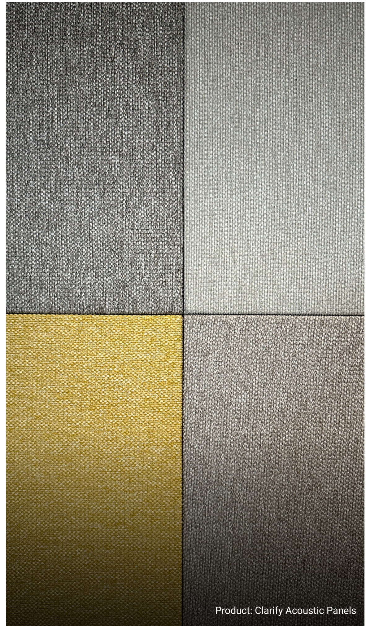
Product: Clarify Acoustic Panels