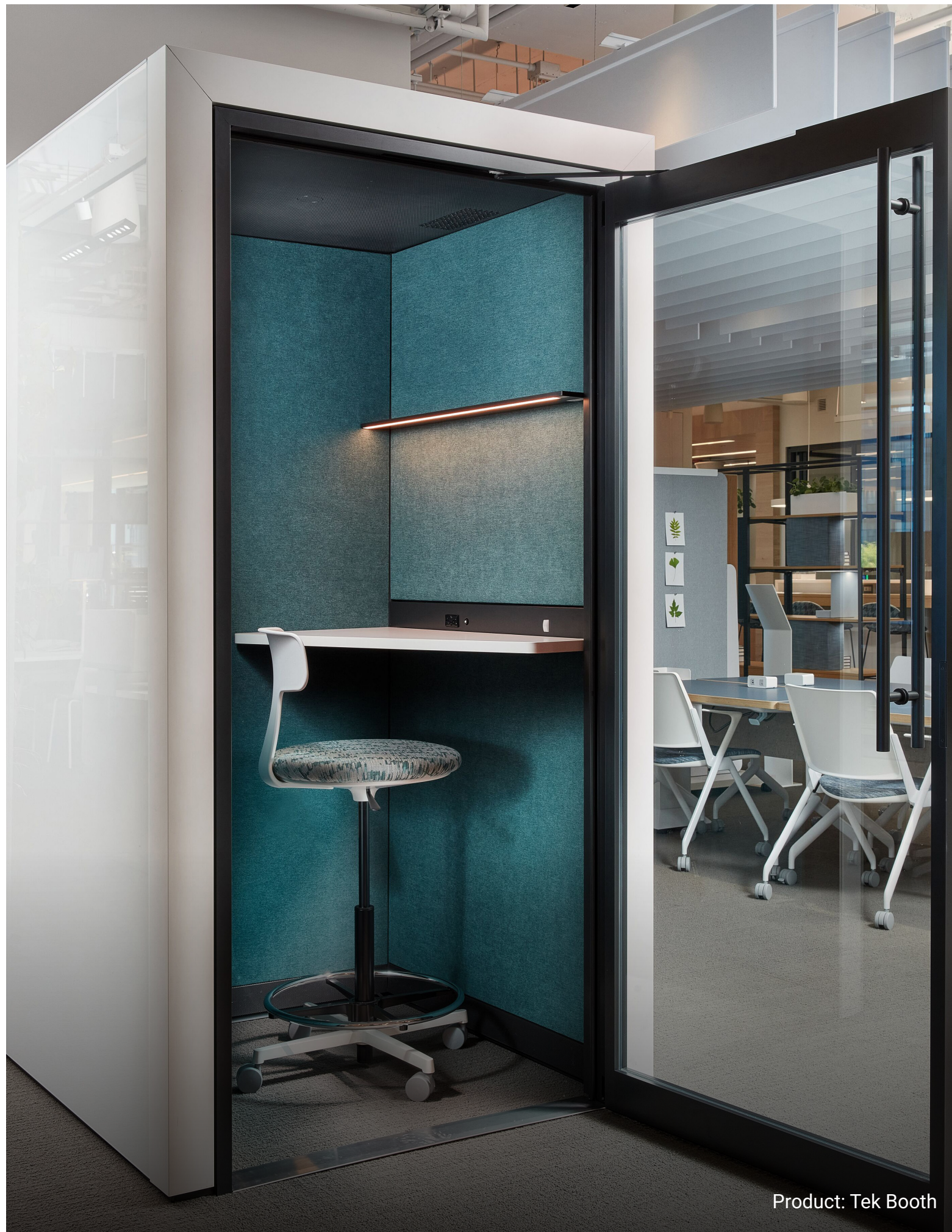
Product: Tek Booth