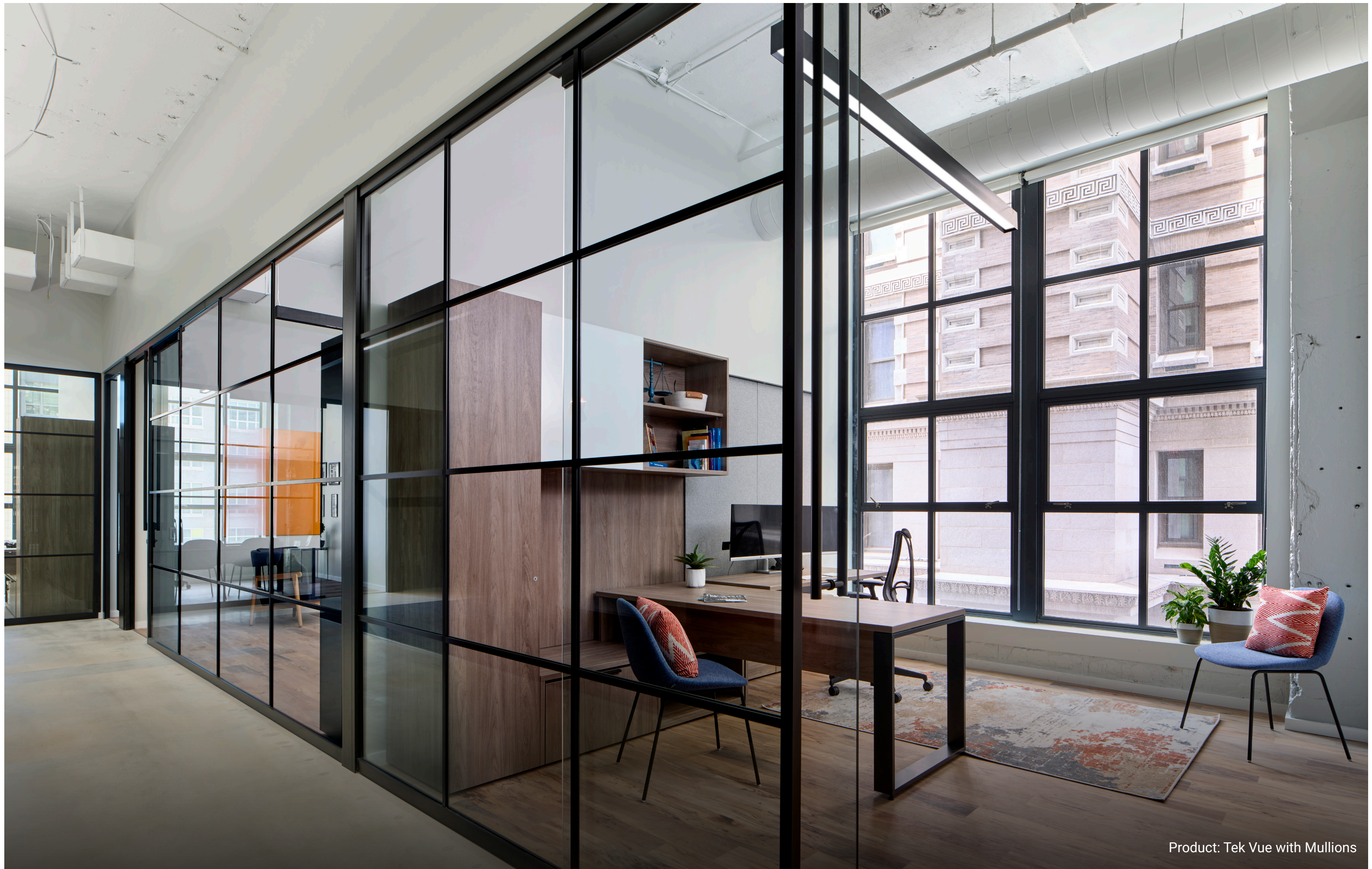
Product: Tek Vue with Mullions