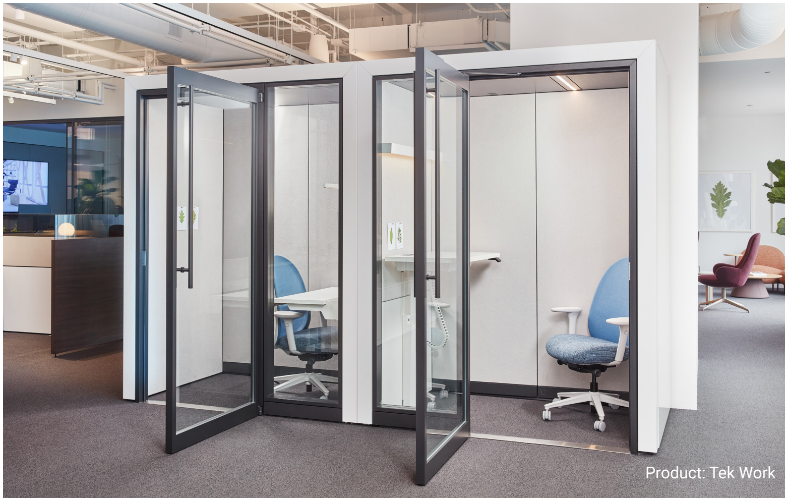
Product: Tek Work