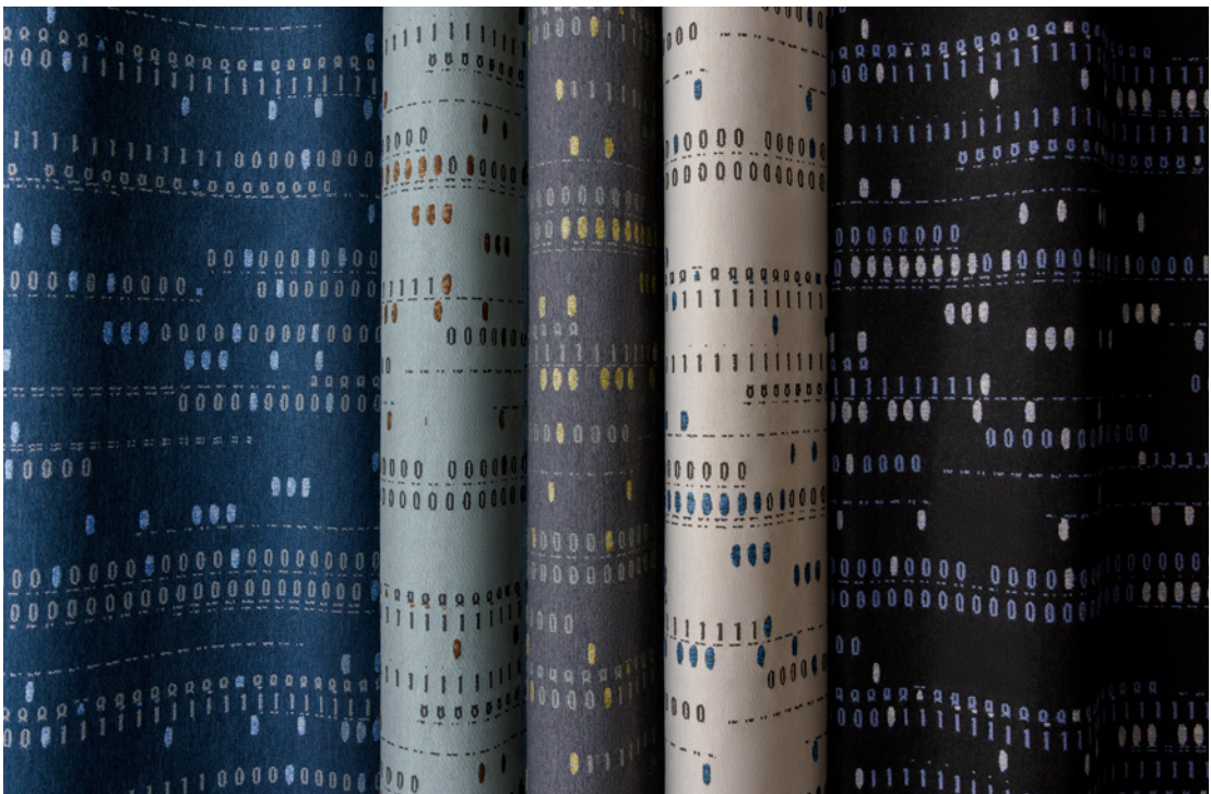
1. Spatial Element